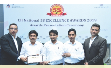
Sandhar Components, Behrampur