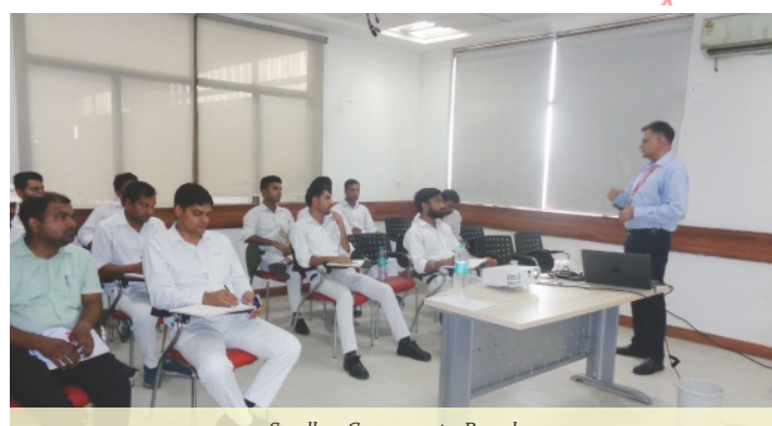
Sandhar Components, Bawal