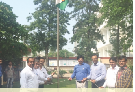
Sandhar Automotives, Gurgaon