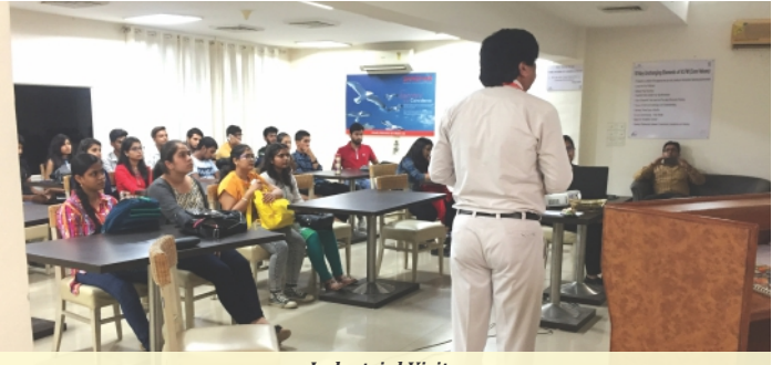
Industrial Visit An industrial visit was organised at Sandhar Automotives, Gurgaon where students of B.Com 1st year from Amity University visited the unit on 9th August 2019 to gain understanding of manufacturing unit.