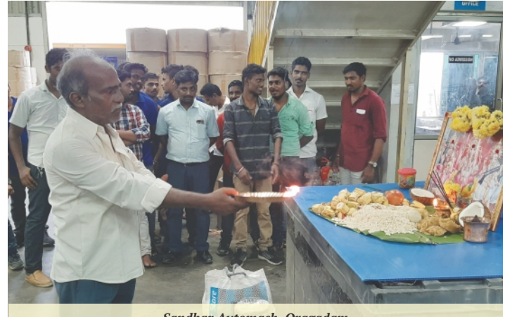
Sandhar Automach, Oragadam