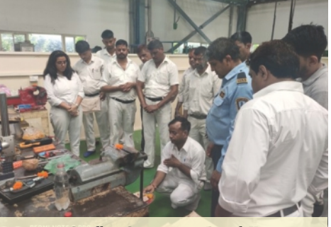
Sandhar Components, Bawal-II