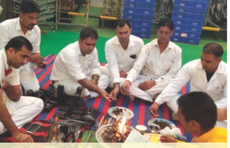
Sandhar Automotives, Haridwar