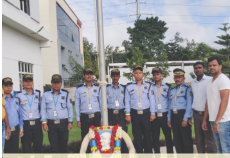
Sandhar Automotives, Bommasandra

"Thousands laid down their lives for our Independence. Never forget their sacrifice." Various units of Sandhar celebrated the independence day by hoisting of flags and cultural activities for the employees.