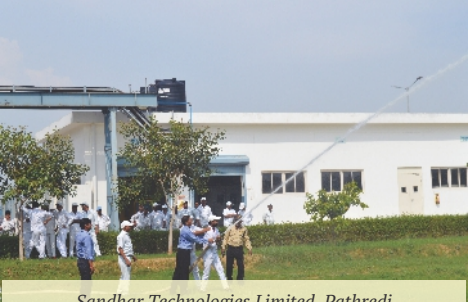
Sandhar Technologies Limited, Pathredi