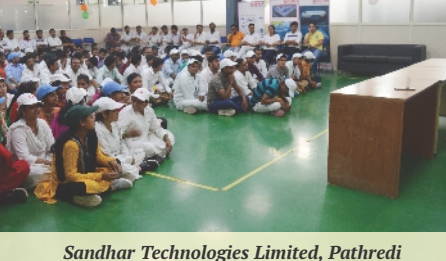
Sandhar Technologies Limited, Pathredi