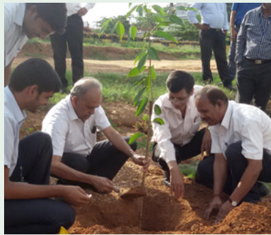
Sandhar Automotives, Bommasandra