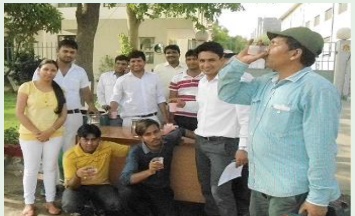
Sandhar Tooling Pvt. Ltd.