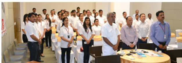
SGQKC - Northern Region