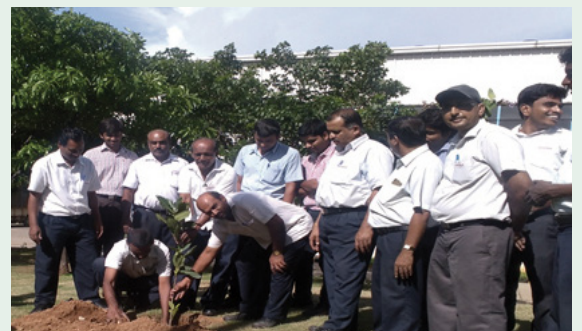
Sandhar Components, Attibele