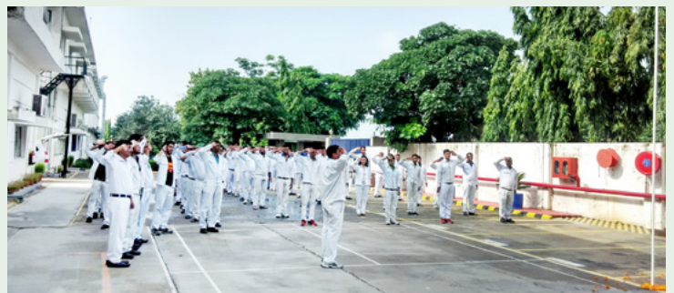
Sandhar Automotives, Dhumasapur