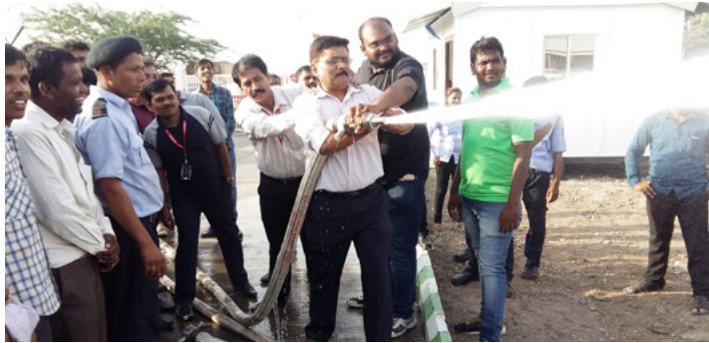
Sandhar Automotives, Pune

Sandhar Automotives, Bommasandra; Sandhar Automotives, Gurgaon and Sandhar Automotives, Pune conducted training programmes on fire fighting. Demo was given to employees on usage of fire Extinguishers & types of extinguishers. The mock drill provided details on use of fire extinguishers in case of emergency.