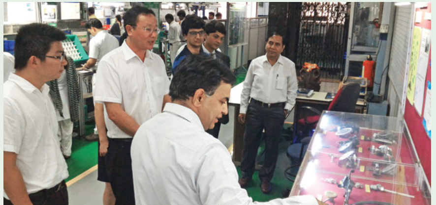
The delegates from SYE China visited Sandhar Automotives, Gurgaon to see the production facilities