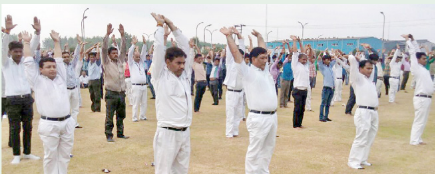
Sandhar Components, Haridwar