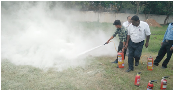
Sandhar Automotives, Bommasandra