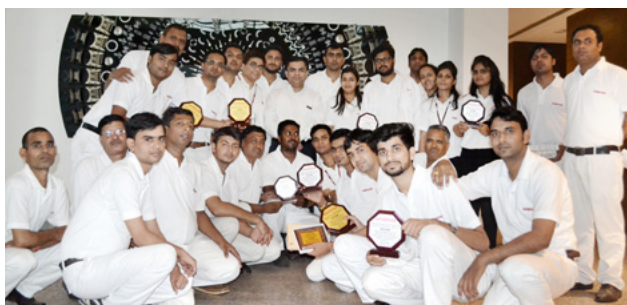
SGQKC - Northern Region

After dropping two atomic bombs on the Japanese cities of Hiroshima and Nagasaki which killed an estimated 39,000 people; General Douglas McArthur commander of the allied forces in Japan felt that image of America had to be restored. Hence he requested U.S. government to send management experts to help rejuvenate Japan. A group of delegates from America closely worked with JUSE for this purpose. Some of the delegates were Dr. Shewart, Deming, Phillip Crosby and K. Ishikawa.