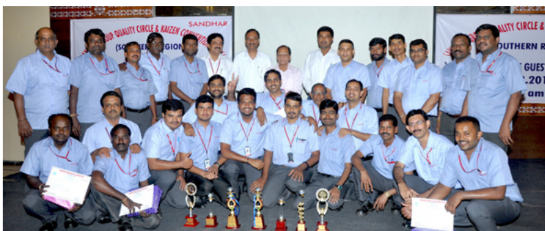
SGQKC - Southern Region