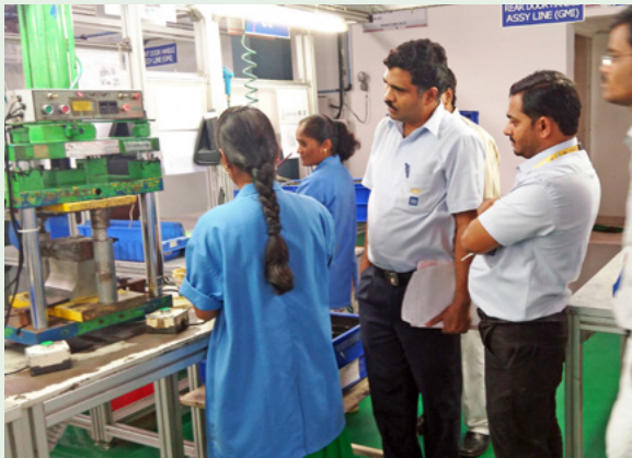
A team from General Motors visited Sandhar Automotives, Pune for system audit