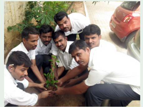
Sandhar Automach, Attibele