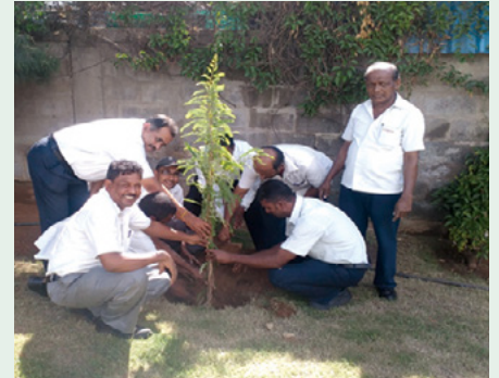
Sandhar Components, Attibele