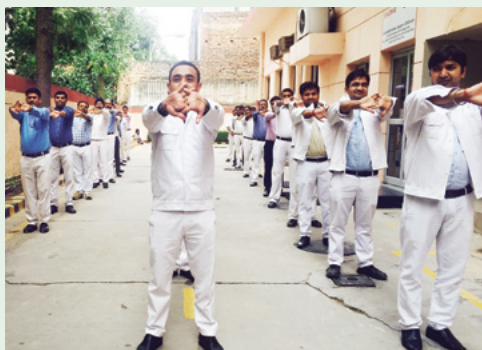
Sandhar Automotives, Gurgaon