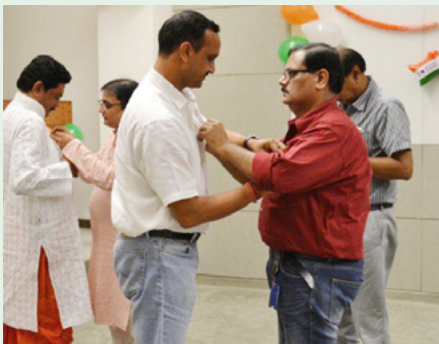
Flag pinning ceremony at Corporate Office