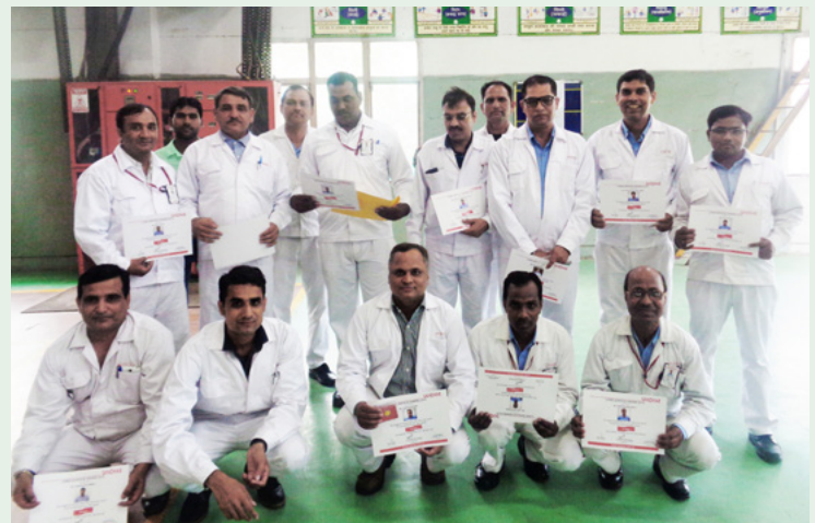
Sandhar Components, Manesar Long Service Award Winners - June, 2016