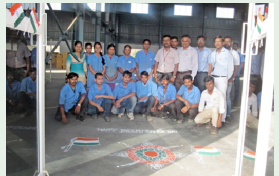
Sandhar Automotives, Pune