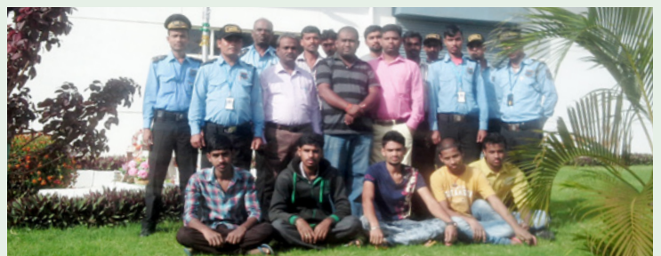
Sandhar Automotives, Bommasandra