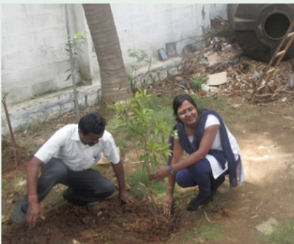
Sandhar Automach, Attibele