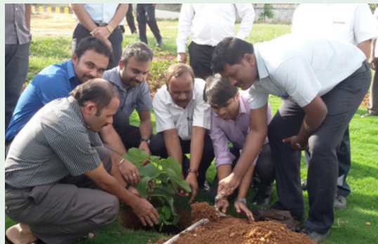
Sandhar Automotives, Bommasandra