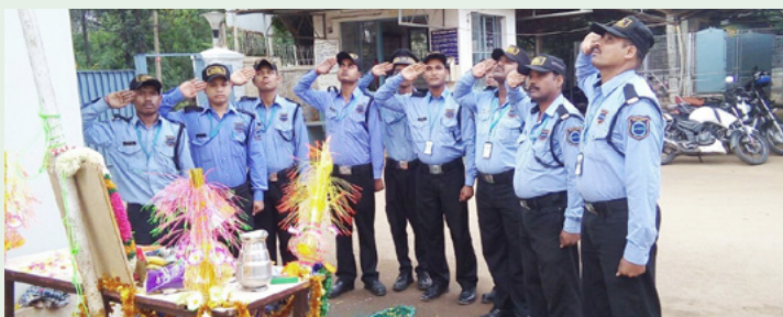
Sandhar Automotives, Attibele