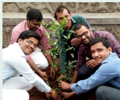
Sandhar Automotives, Pune