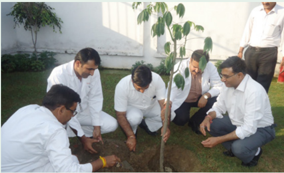
Sandhar Automotives, Haridwar

On the world environment day, a special focus is put on the environment and our commitment to sustainability is reiterated by planting trees in and around our workplace.