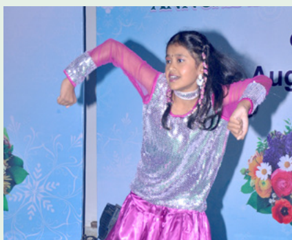
Cultural Activities by Employee's Children