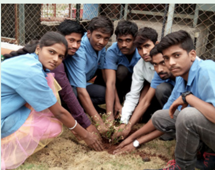
Sandhar Automotives, Pune