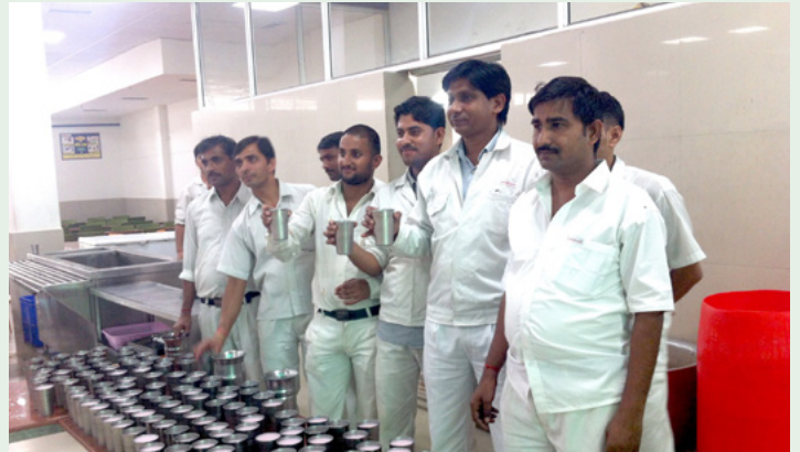
Sandhar Automotives (Dhumaspur)

Nirjala Ekadashi falls on the 11th Lunar day of the waxing fortnight of the Hindu month of Jyestha .The Ekadashi derives its name from the water-less (Nir-jala) fast observed on this day. It is considered as the most austere and hence, most sacred of ekadashis. On this day lot of people consider the distribution of Sweet and flavoured water to passerby's and thirsty as very pious. Some of our units celebrated this with enthusiastic participation by our employees.