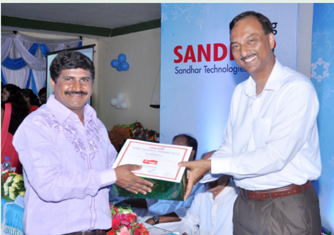
MAG Engineering, Long Service Award, June, 2016