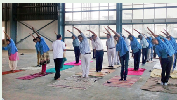
Sandhar Automotives, Pune