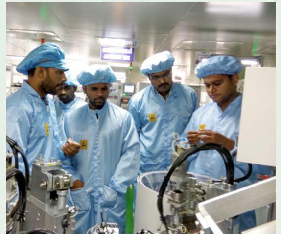
Royal Enfield Team Visited Sandhar Automotives, Gurgaon