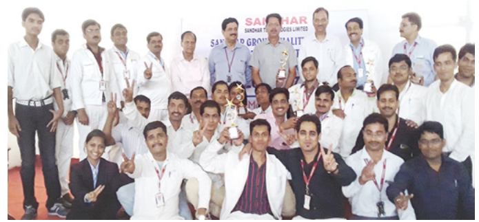
SGQKC - Western Region

Sandhar Group Quality Circle & Kaizen Convention -2016 for Northern Region was held on 9th & 10th September 2016. 38 Quality Circles & 32 Kaizen were presented in the convention and out of 38 Quality Circles, 20 teams won Gold, 12 teams won Silver & 6 teams won Bronze. Some glimpses of these events are as follows: