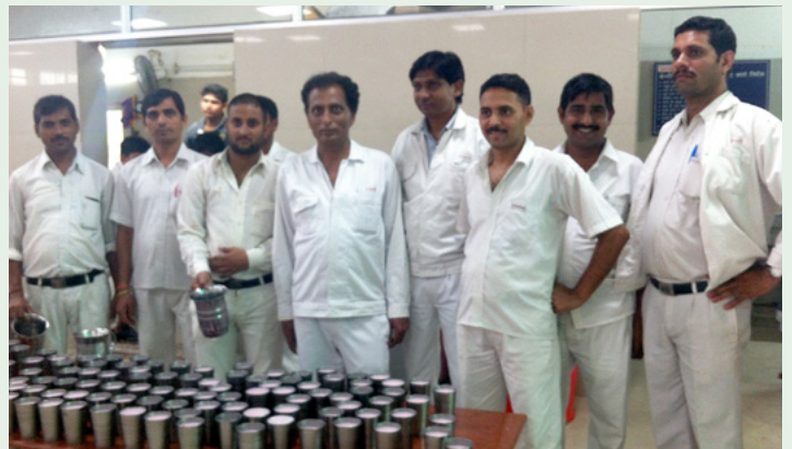
Sandhar Automotives, (HSCI Division)