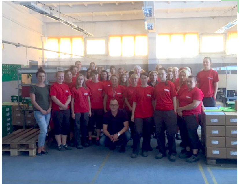
Some Members of Sandhar Technologies Poland Team

The positive outcome of both the audits was due to the focus and hard work of the entire team.