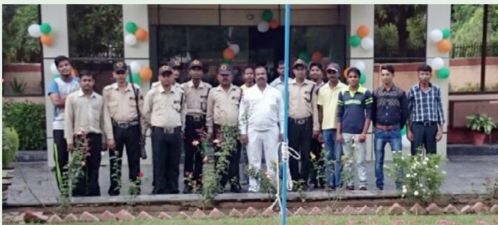
Sandhar Automotives, Gurgaon