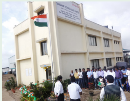
STL Cabins and Fabrication Division