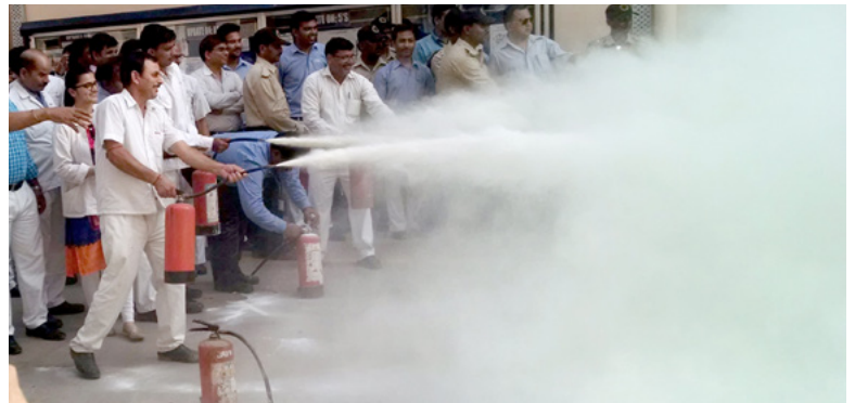
Sandhar Automotives, Gurgaon