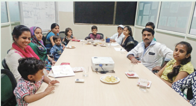
Family Day at HSCI