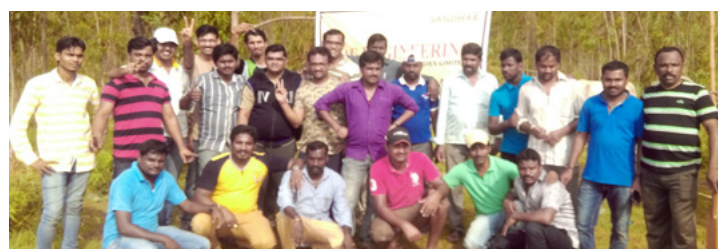
Winners in Cricket