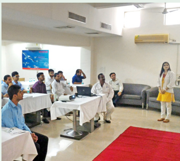
The graduate engineer trainees from Hero MotoCorp. visited Sandhar Automotives, Gurgaon to get a first hand experience about our operations and facilities