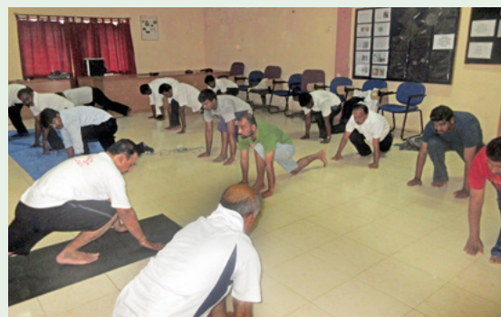
Sandhar Components, Attibele