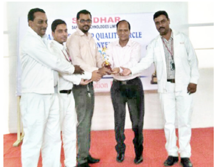
SGQKC - Western Region