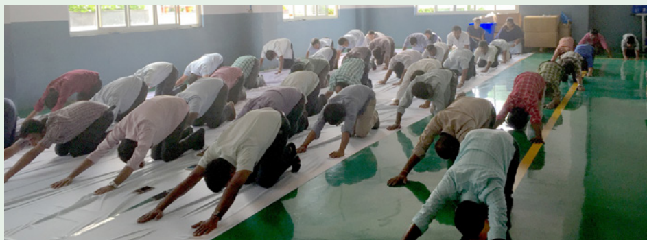
Sandhar Automotives, Bommasandra