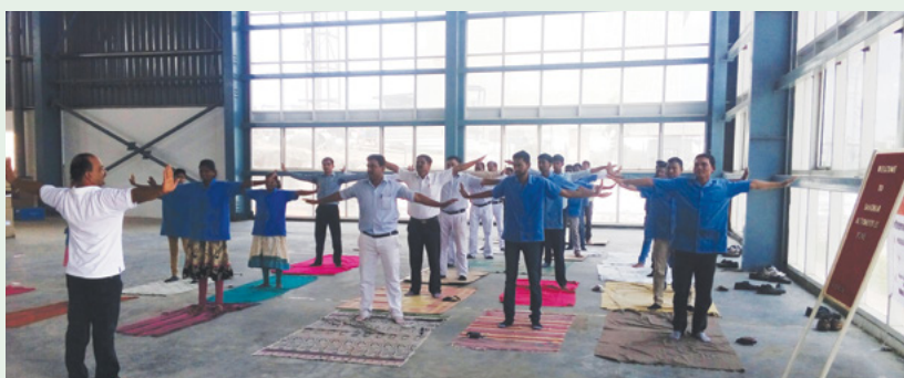
Sandhar Automotives, Pune

On this International Yoga day, various units of Sandhar actively participated in the event by organising awareness sessions followed by practical Yoga. Some glimpses of International Yoga Day at Sandhar: