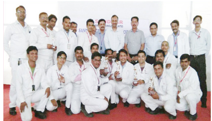
SGQKC - Western Region