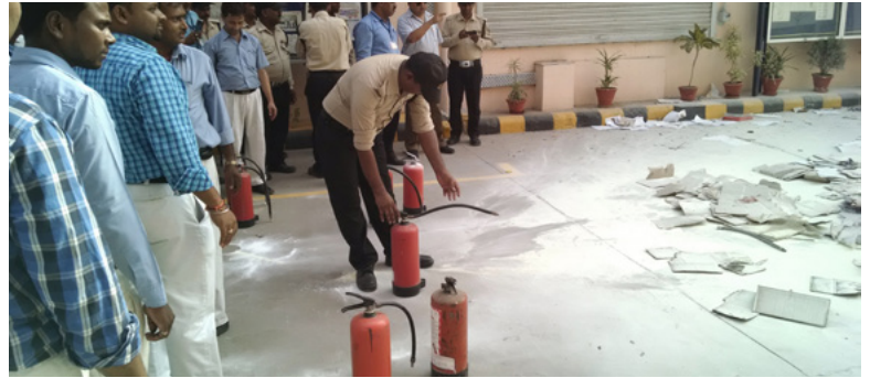
Sandhar Automotives, Gurgaon