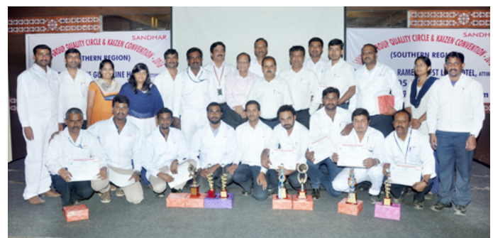
SGQKC - Southern Region