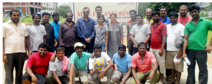
Winners in Volley Ball