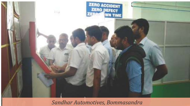
Sandhar Automotives, Bommasandra

As a new initiative a training on “online leave application through KIOSK machine” for Company Operators and Staff was given at Sandhar Automotives, Bommasandra and Sandhar components, Attibele. This initiative will help in digitalizing the leave system, which is part of the overall digitalisation of the H. R. Process in Sandhar.