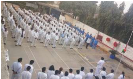
Sandhar Automotives, Dhumaspur

Many units across Sandhar celebrated the nation's Republic Day on January 26. It is a day to remember when India's constitution came into force in 1950, completing the country's transition toward becoming an Independent republic. Programme started with Flag hoisting followed by pinning of badges & then sweets were distributed to all the employees. At Sandhar Cabins & fabrication Division, Pune the day was celebrated along with Kobelco team from India & Japan, who were visiting during that time.