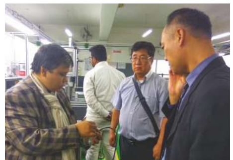
Delegates from ACE Technologies visited Sandhar Automotives, Dhumaspur, Fuel sender division and Honda car division for understanding the manufacturing process and exploring new business opportunity.