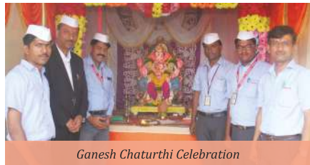
Ganesh Chaturthi Celebration