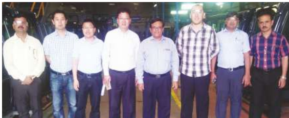
Xcmg China Team at Cabins & Fabrication, Division, Pune