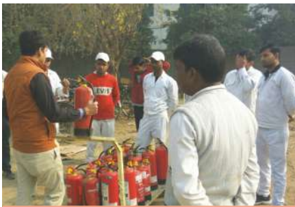
Honda Car Division- Dhumaspur

Safety is of utmost importance to any organization. A Mock Drill on fire safety – types of fire, types of extinguishers, how to douse fire, First Aid etc. was conducted for employees of Honda car Division at Dhumaspur Gurgaon and Sandhar Tooling Pvt. Ltd. Manesar.