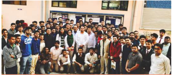
Students from Swami Keshwanand Informational and Tech Engineering College visited Sandhar Automotives, Gurgaon to understand the company operations and Processes.