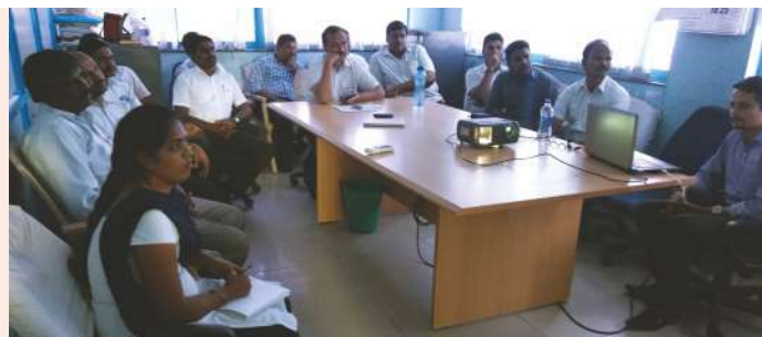
Communicable diseases training at Sandhar Components, Attibele