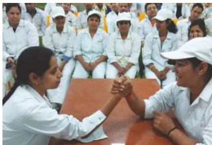
Sandhar Automotives, Dhumaspur