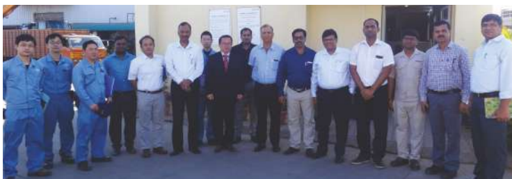
Kobelco Team at Cabins & Fabrication, Division Pune