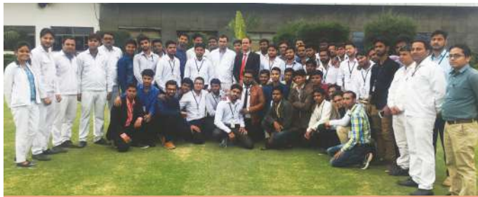
Students from Maharana Pratap college, Kanpur visited Sandhar Automotives, Haridwar on 7th March 2017. They were shown the Company Presentation, followed by shop floor visit. After visiting the plant, their queries related to the manufacturing processes were answered.