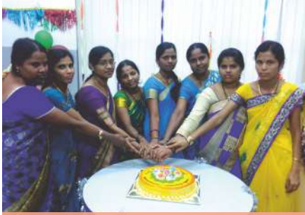
Sandhar Automotives, Bommasandra