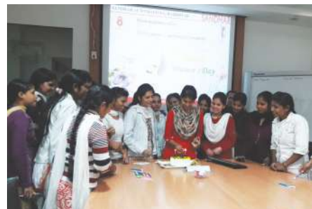
Sandhar Automotives, Haridwar