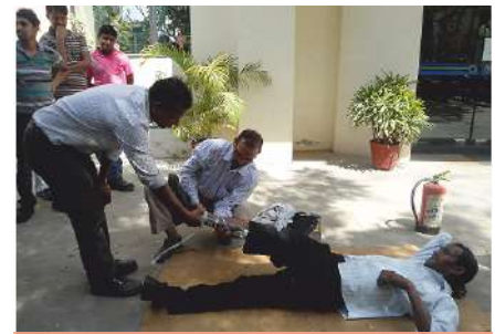
Sandhar Tooling Pvt. Ltd.