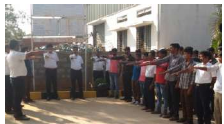
Sandhar Automach, Mysore