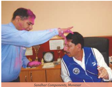
Sandhar Components, Manesar

Holi the festival of colors, a day when we choose to play with colors, laugh & enjoy, was celebrated on 13th March, 2017. On the occasion, sweets were distributed along with colours.