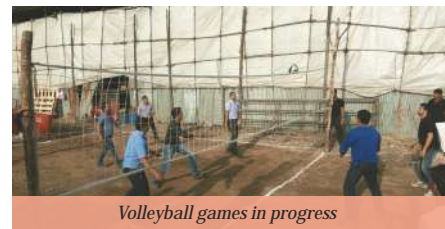
Volleyball games in progress

The Canteen facility is outsourced and is operated in the adjacent building owned by the canteen contractor.