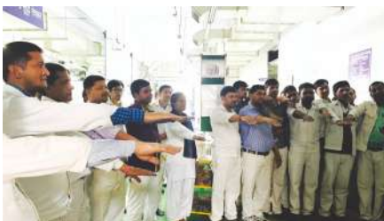
Sandhar Automotives, Gurgaon