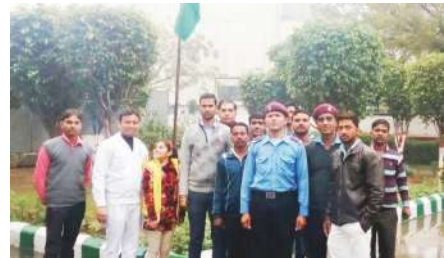
Sandhar Components, Manesar