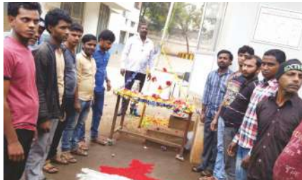
Sandhar Automach, Attibele