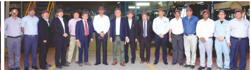
Kobelco Senior Team Visited Cabins & Fabrication, Division, Pune