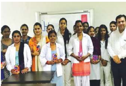
Sandhar Automotives, Gurgaon