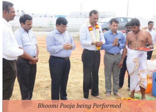
Bhoomi Pooja being Performed

The new plant once operational would cater to Construction Equipment Manufacturers in and around Chennai and create a win-win situation for both sides.