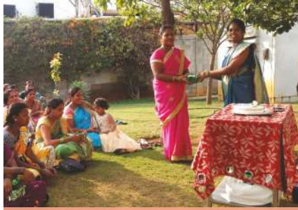
Sandhar Components, Attibele