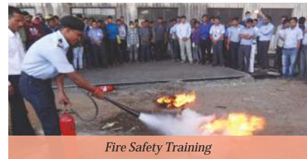
Fire Safety Training