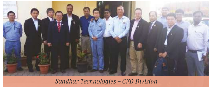
Sandhar Technologies - CFD Division