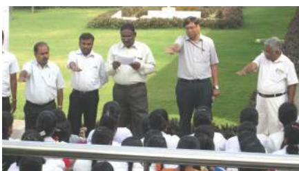
Sandhar Automotives, Bommasandra