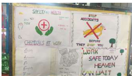
Sandhar Automach, Attibele