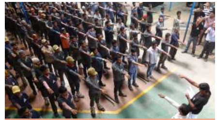
Cabins & Fabrication Division, Pune