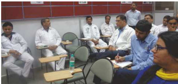
Training on Belongingness to company