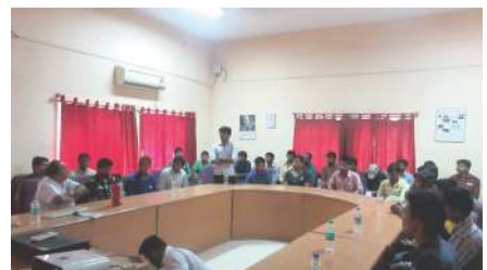
Sandhar Components, Attibele