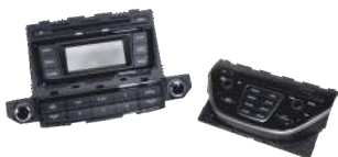
Audio AVN Panel Assembly