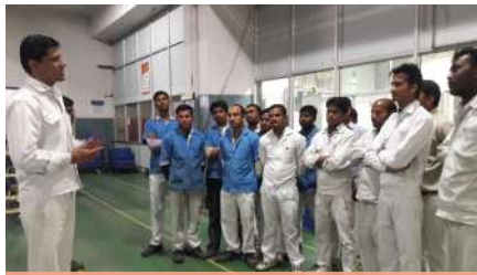
Sandhar Automotives, Haridwar

When we work as a team we must ensure that its about working together & protecting one another for a better & safer workplace, considering the same, in the month of March, 2017 Safety week was celebrated at various units across Sandhar with activities like Safety communication through banners, posters & Slogan competition, Quiz Competition & Safety trainings as well. Program started with the Safety oath followed by presentation on safety and ended up with the prize distribution.