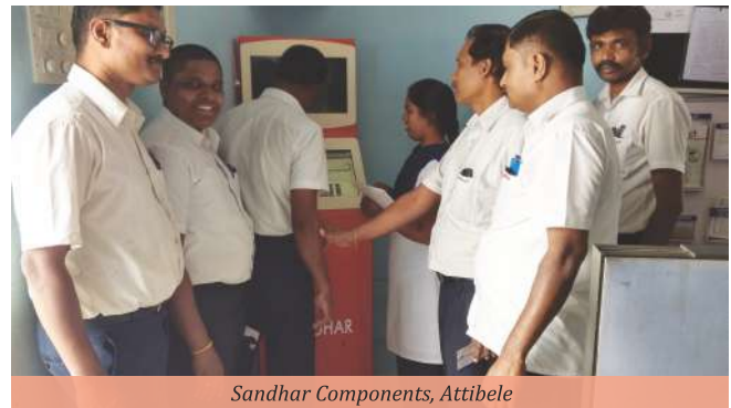
Sandhar Components, Attibele