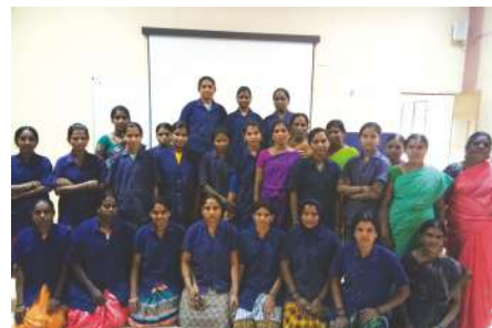
Sandhar Automach, Attibele

Going on with the statement, Women's day was celebrated in various units of Sandhar on 8th March, 2017. The Celebration included activities such as Gynae Session, Singing, Rangoli making, fun games, Races & Cake cutting. Snacks were also distributed along with a small gift of appreciation. Some of the Glimpses are as under